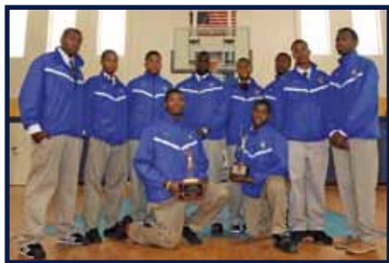
2011 GISA State Runner-Up for basketball GO BLAZERS!