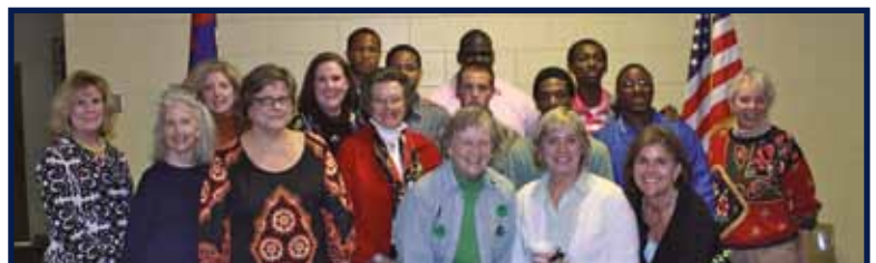
Members of the Women's Board and the Class of 2011

The Women's Board is the driving force behind campus Christmas and Easter celebrations. They have played an active role in cottage renovations, in addition to regularly reinforcing the value of education by sponsoring academic awards, honor roll accolades, and the annual essay contest highlighted at the Anniversary Celebration. The Women's Board also sponsors one of Bethesda's valued rites of passage: the Senior Ring Day ceremony. Bethesda's "Cottage Life & Residency" platform is well supported by the dedication of this group.