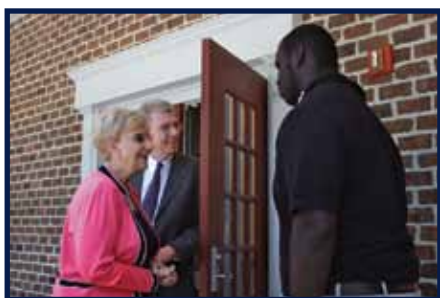
Georgia's First Lady, Sandra Deal, tours Bethesda