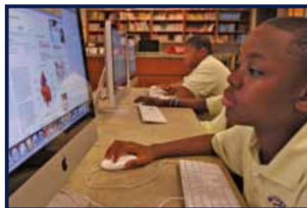
The Quest Foundation provided 50 Apple computers

Georgia Southern University Athletic Foundation, Inc. Hampton Golf, Inc. Heavenly Spa by Westin Savannah * Heiwa's Japanese Restaurant * Henderson Golf Club * The Heritage Bank The Home Depot * HostSouth * Hussey, Gay, Bell & DeYoung Hyatt Regency Savannah * Inglesby, Falligant, Horne, Courington & Chisholm, P.C. Jalapenos Mexican Grill * JT Turner Construction Co., Inc. JTVS Builders, Inc. Kasey's Gourmet Grill * Kentucky Fried Chicken of Statesboro Kimco * Lane-Lee Trucking Co. Levy Jewelers Liberty Mutual Group, Inc. TRES, LLC Logan's Roadhouse * Margol & Pennington, P.A. Martin Marietta Materials The Melting Pot * NMFS Skidaway Island Institute of Oceanography * Olive Garden * Ovation Wireless Management, Inc. Pro-Legal Copies, Inc. Publix Supermarket * Remediation Resources, Inc.