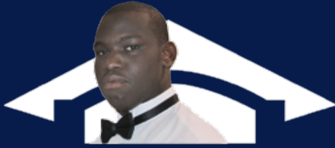
COTTAGE LIFE & RESIDENCY

“My houseparents gave me the freedom to make my own choices, but they held me accountable for those decisions.”