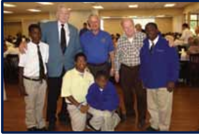
Bethesda boys, past and present

The Bethesda Alumni Association is one of the ways that former students and residents of Bethesda fellowship while supporting the current student body. The president of the Alumni Association holds an ex-officio position on the Board of Governors, keeping alumni informed about the place that made such an impact on their lives. The Alumni Association helps prepare and host the Thanksgiving Luncheon for the students, plays in the Anniversary Day Alumni vs. Student Softball Game, and presents each graduate with an engraved Bible at the Commencement Ceremony.