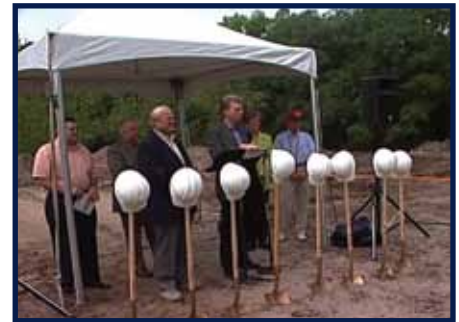
Groundbreaking ceremony for the Eckburg Education Center, 2004