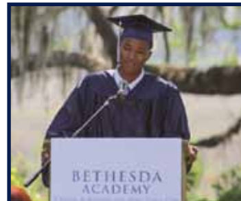
2011 Commencement Ceremony