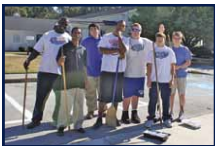
The Key Club service project at Ferguson Avenue Baptist Church

Club participation serves as a vehicle to build students' interpersonal skills while reinforcing their work ethic. At Bethesda, our clubs are an extension of our core values. Through the Fellowship of Christian Athletes students develop a more meaningful relationship with God. Members of the Chess Club exercise their critical thinking skills, and the Key Club practices servant leadership through community service.