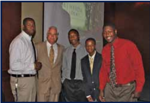
Mike Smith and Bethesda athletes

Bethesda's Sports Banquet took place on May 12, 2011, with Atlanta Falcons Head Coach Mike Smith as the keynote speaker. The banquet was held at the Hyatt Regency Savannah. Coach Smith spoke eloquently about the importance of discipline on and off the field. The Bethesda students took to heart all that Coach Smith had to say. Some of them even took notes during the presentation!