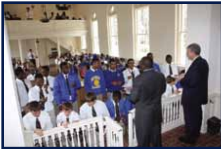
Weekly chapel service

Aggregates USA Ashridge, Inc. AV Logistics Baker Infrastructure Group, Inc SunTrust Banks BankSouth Bart, Meyer & Company BB&T Doug Bean Signs * Belk * Blue Force Gear, Inc. Bouchillon's Collision Center, Inc. Brasseler USA C & K Trucking, LLC C. F. Knight, Inc. Charles Hyman & Co Coastal Grass & Landscaping Inc. Coomer, Coomer & Routhier, P.C. T. L. Cannon Management Corporation