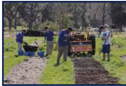
Planting fresh crops

Cutter's Point Coffee * Dabbs, Hickman, Hill & Cannon, LLP Dan J. Sheehan Company * Dixie Eggs Driftaway Café * The Drummond Press Duval Asphalt Ed Smith Construction Co., Inc. BLE Enterprises Evans General Contractors Ferguson Enterprises Fiddler's Crab House Southside * Flournoy & Jagger The Ford Plantation * Four Points by Sheraton * F.P. Wortley Jewelers * Friedman's Fine Art * Gavilon Fertilizer * George K. Gannam Unit 184, American Legion Auxiliary * Georgia Emergency Associates Georgia Power Company Georgia Surveyors Exchange Company Glow MedSpa & Beauty Boutique * Griffin Brothers Companies