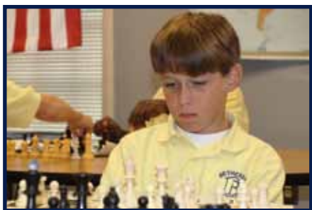
Bethesda's Chess Club is ranked 16th in the nation.

Club participation serves as a vehicle to build students' interpersonal skills while reinforcing their work ethic. At Bethesda, our clubs are an extension of our core values. Through the Fellowship of Christian Athletes students develop a more meaningful relationship with God. Members of the Chess Club exercise their critical thinking skills, and the Key Club practices servant leadership through community service.