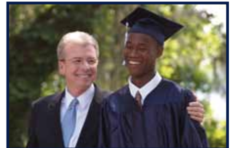
First Commencement Ceremony for newly-named Bethesda Academy, 2011