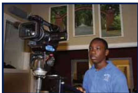
Students gain studio production experience

We live in an age where information is a key element of business and the ability to convey this information through technological means is a coveted talent. Bethesda Academy has taught video production for nearly a decade. This medium has become more relevant than ever with the increasing reliance upon the Internet among businesses everywhere. Students learn studio and field production, editing, graphic design and more. Bethesda Academy also airs local programming through a decade long partnership with Comcast Cable Corporation. In addition to airing our own flagship program, A Look Through The Arch , Bethesda Video Productions airs and produces programs for clients and generates revenue through the sale of airtime to local businesses, churches, and non-profits.